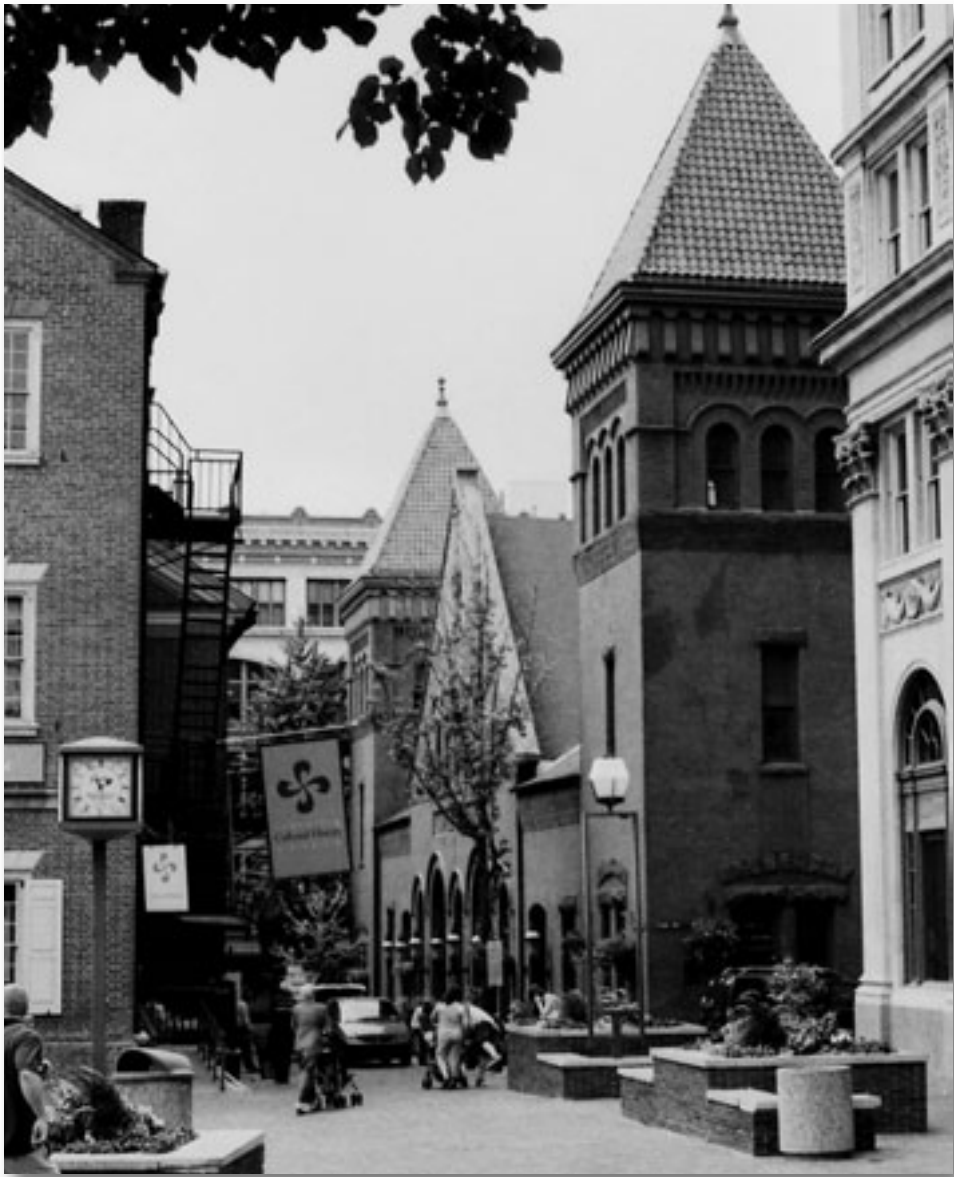
Central Market in Penn Square.

Sometimes simple questions can be the most difficult to answer. For instance, when I recently polled a group of constituents and asked them to name their favorite building in Lancaster County one person likened it to having to pick their favorite child. That certainly speaks to the emotional connection we feel to the structures around us.