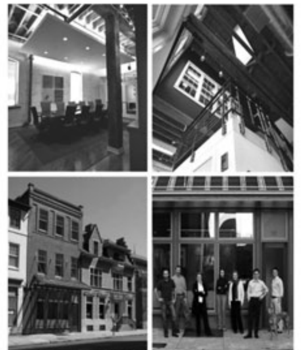
TIPPETTS/WEAVER architects, inc 137 north duke street lancaster, pennsylvania 17602 p.717.394.0553 / f.717.394.0052 tippettswaiver.com

2nd & Cherry Streets P.O. Box 68 Columbia, PA 17512 Telephone 717.684.4325