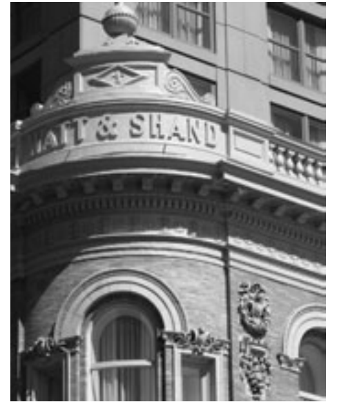
The iconic Watt & Shand facade.