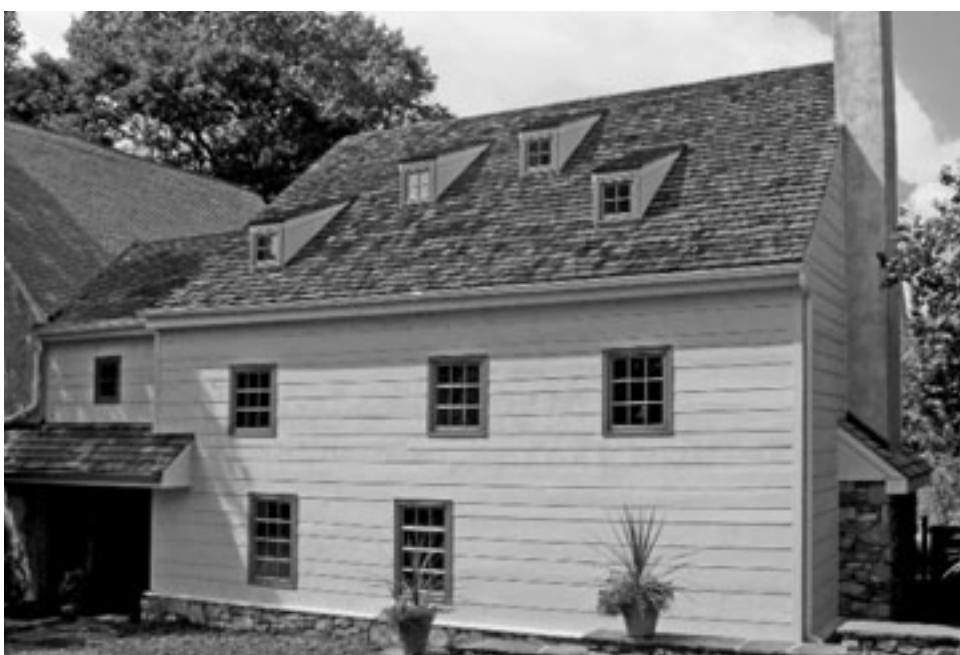
Completed addition from entry court.