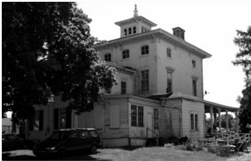
Mayer-Hess Farmstead in Manheim Township.