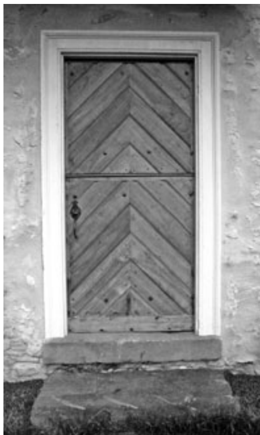
Chevron Dutch entry door.