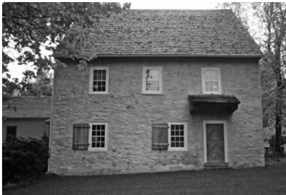
Restored 18th century facade.

Photography: PADEN DE LA FUENTE ARCHITECTS