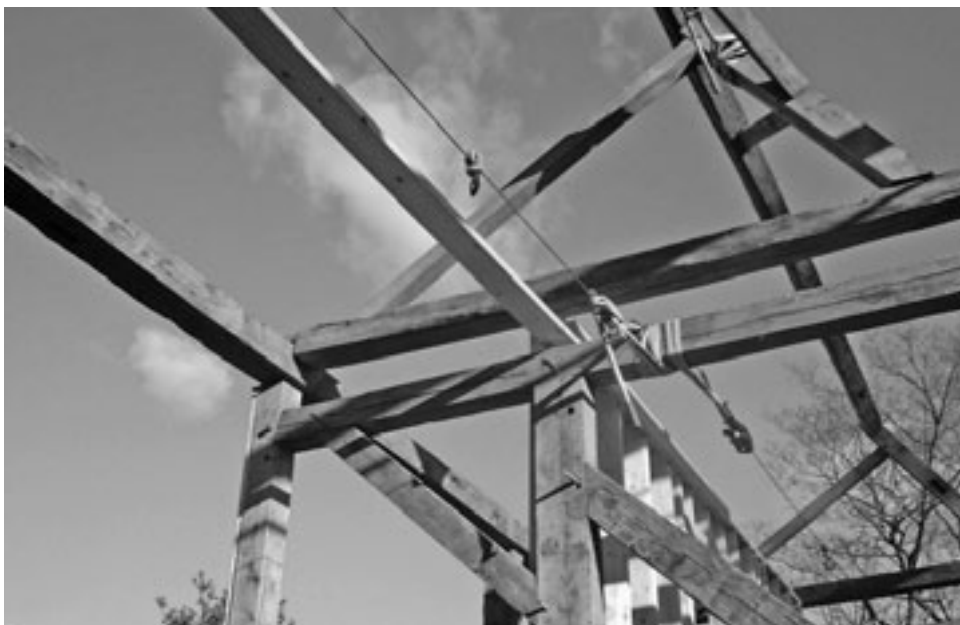
Erecting the salvaged 19th century timber frame.