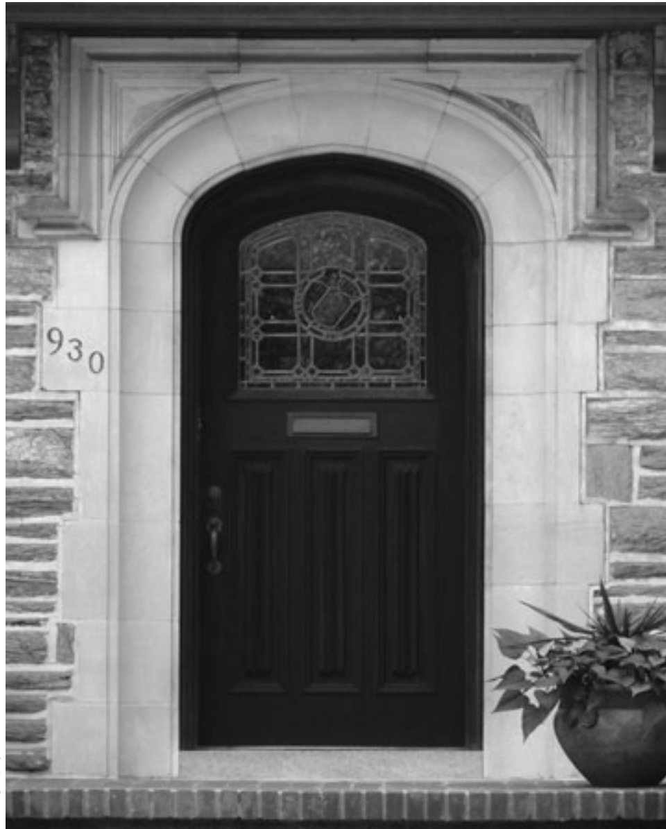
930 Buchanan Avenue.

The Architectural History Tour only happens once every two years so be sure not to miss it.