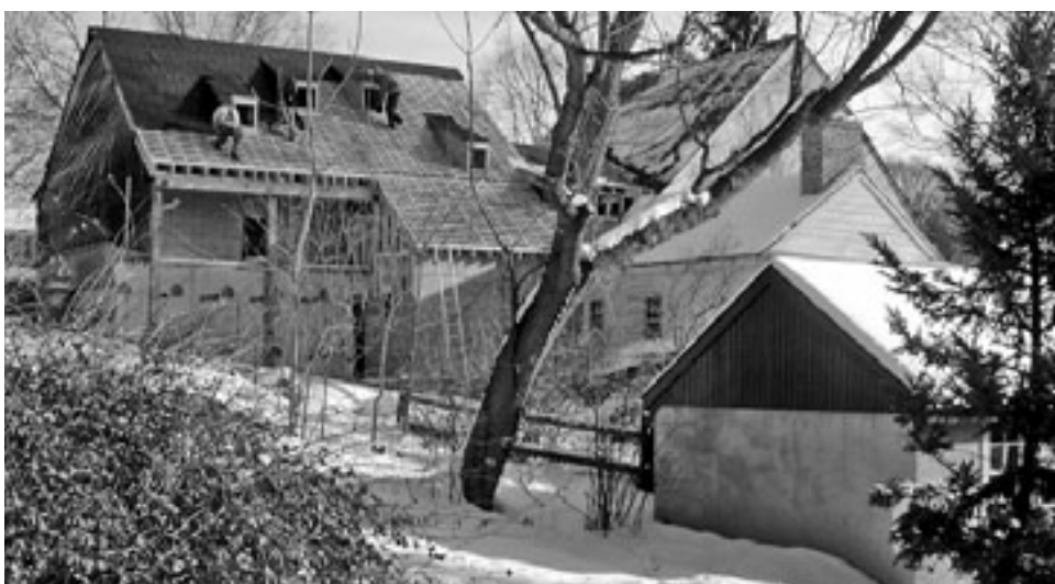
Setting the cedar shake roof.