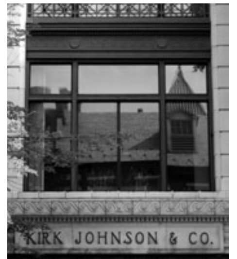
Kirk Johnson building.