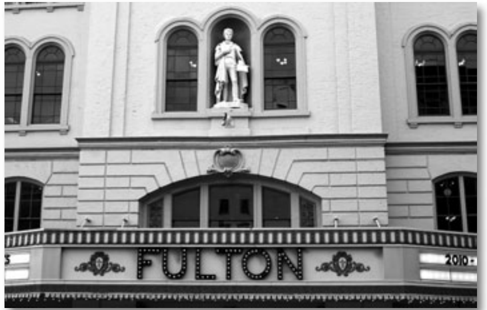
Fulton Opera House in City of Lancaster.